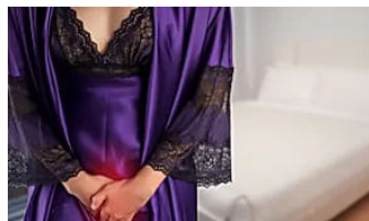
Eugene: Battling Bladder Control Problems? Start Your Research Here Yahoo! Search