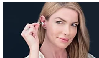
Experts Call This the Hearing Aid of the Future Fargo