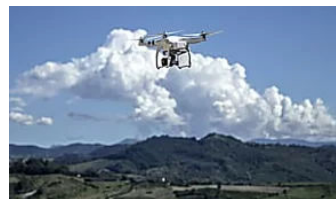
Drone Deployed by AT&T is Providing Cell Service in Puerto Rico CtaTech