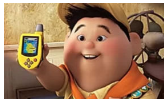
Most Adults Can't Pass This Basic 2nd Grade Test. Can You? Offbeat