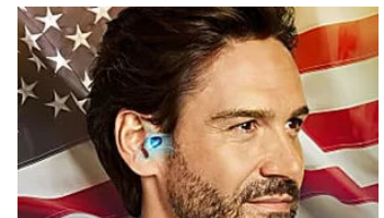
SIEMENS Bluetooth hearing aids will change your life Hear.com