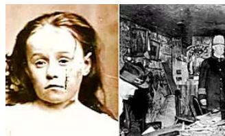
This Girl Was The First Recorded Child Abuse Case, But Who Helped Is Surprising Scribol