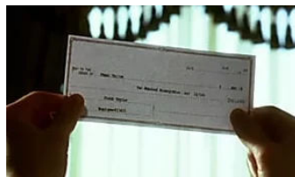
If You Own A Home in Oregon You Can Now Claim Your $4,264 Benefit The Better Finance