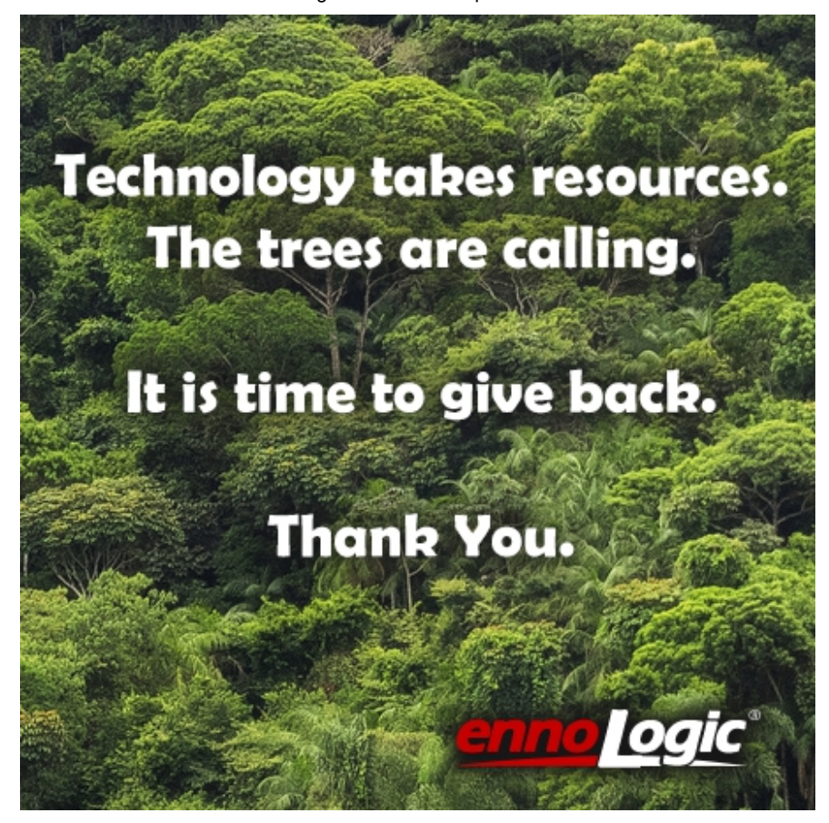
Eugene, United States - November 23, 2017 / PressCable / —

EnnoLogic thanks customers for their support in helping to plant over 5,500 trees in the tropics in 2017 to date.